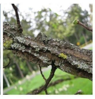
Parksville Arboretum ~ Left to Right: Dove Tree, Trentepohlia (a filamentous chlorophyte green algae), Gingko, bark of Winged Elm You can look forward to an article about Parksville's Arboretum coming up in the October newsletter!

"Bees do have a smell, you know, and if they don't they should, for their feet are dusted with spices from a million flowers."—Ray Bradbury, Dandelion Wine